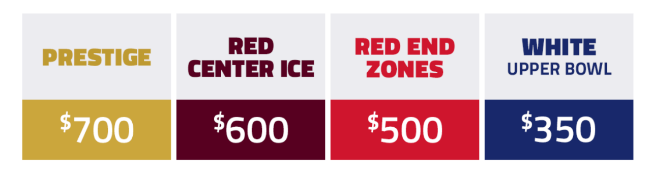
Price including taxes